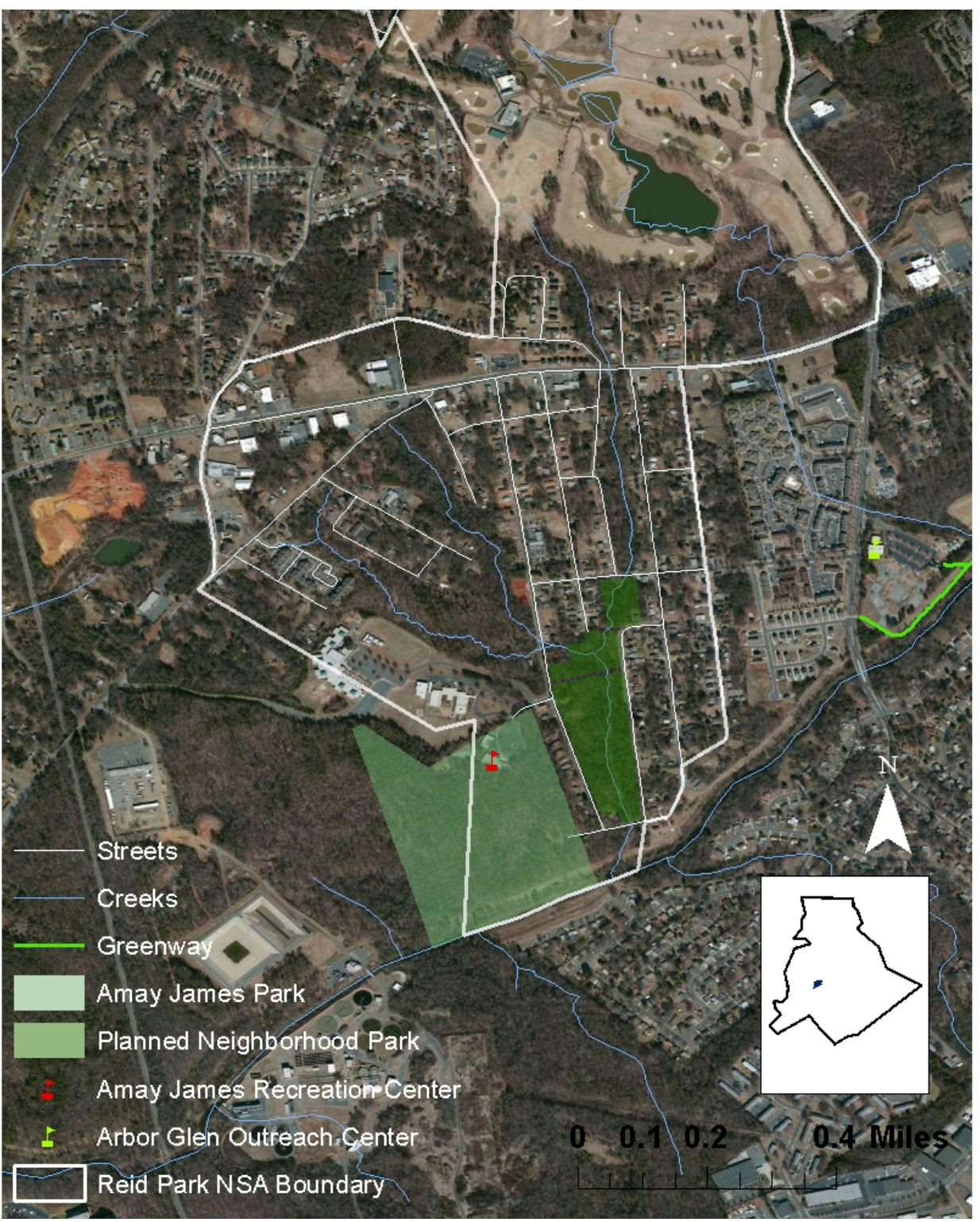
FIGURE 6.1.1. GREEN SPACE/RECREATION SPACE IN REID PARK.