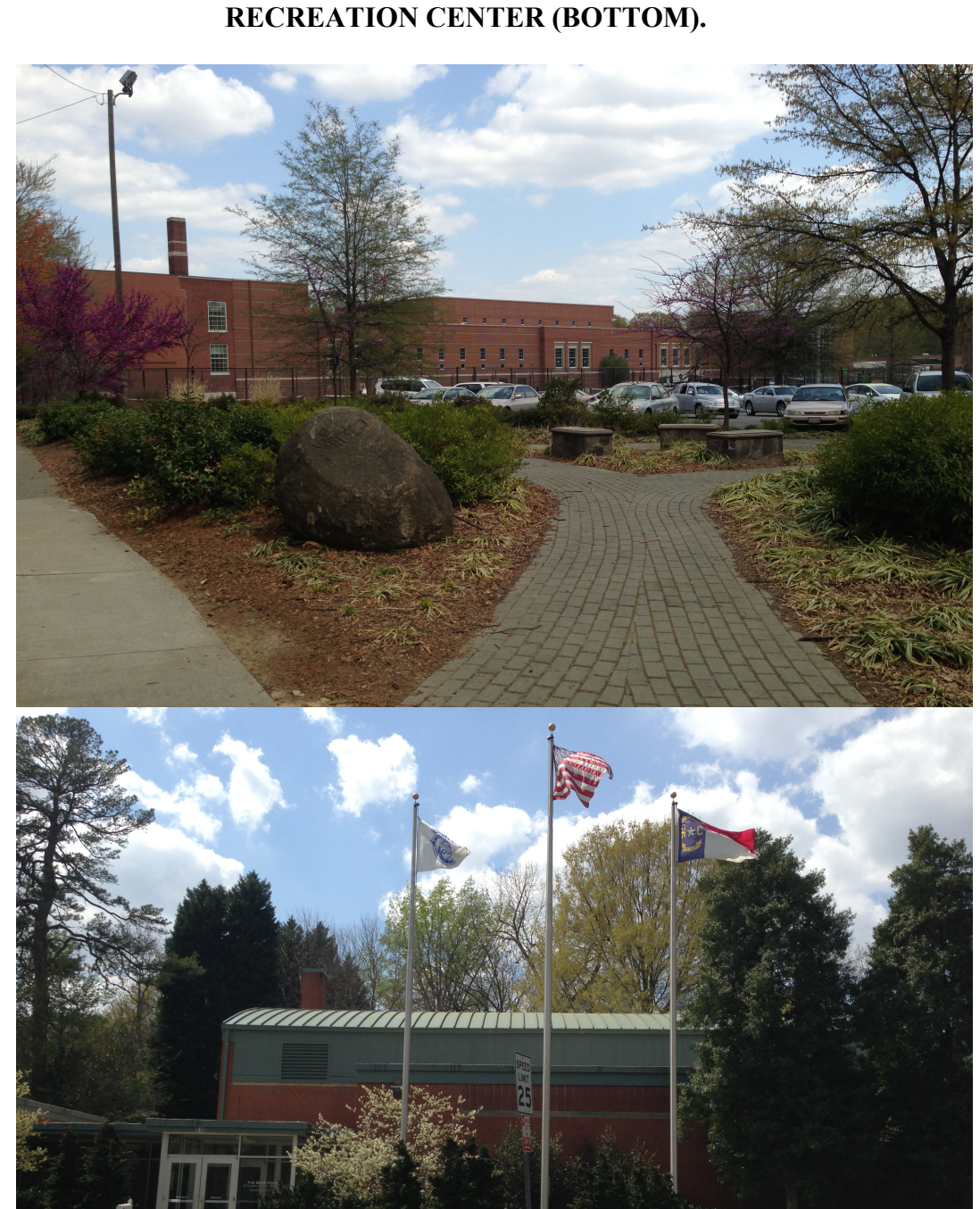
FIGURE 5.1.5. TOM SYKES RECREATION CENTER (TOP) & LATTA RECREATION CENTER (BOTTOM).