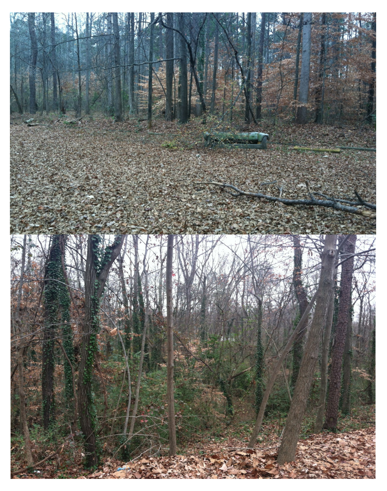
FIGURE 6.1.2. AMAY JAMES PARK.