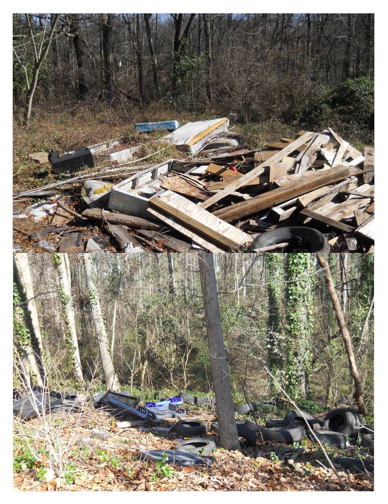
FIGURE 6.1.3. PLANNED NEIGHBORHOOD PARK.